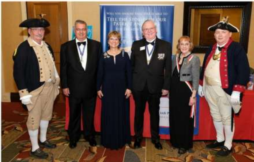
State Conf March 23-25, 2023